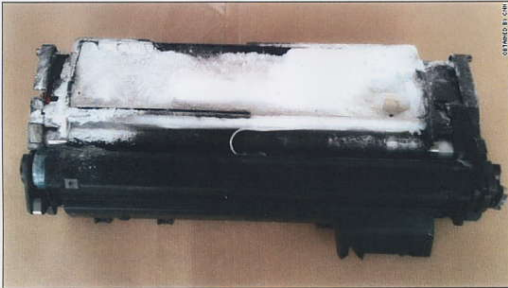
A suspicious package contained a "manipulated" toner cartridge that had white powder on it.